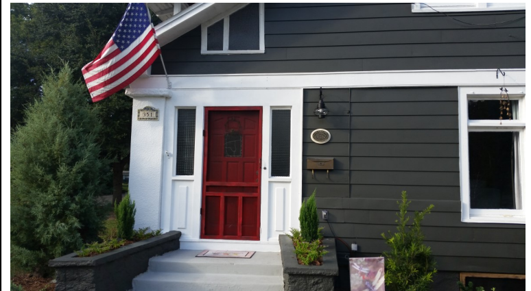
351 W. 10th Avenue

Usually the history of the building or property. A building's name is typically stated in the City's historic buildings survey. Names given to a building usually are those of the original resident, or for that person or persons who lived there the longest, or both. When researching your property make sure you note all names associated with the building as well as when they owned or resided at the property.