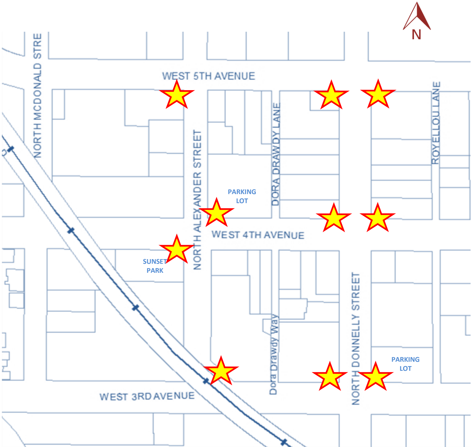
Pole Locations – Revised Oct. 2014